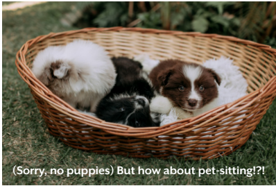
(Sorry, no puppies) But how about pet-sitting!?!